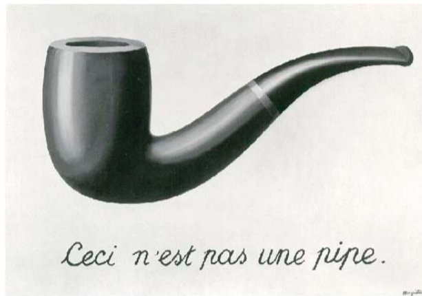
Figure 2: A Semiotic Painting

Magritte's point was to remind viewers that his representation—oil smeared on parchment—is not a pipe. It is a symbol. The semiotic meaning of Magritte's painting is achieved by a visual combination of the picture with the text "this is not a pipe." Magritte intends viewers who do perceive a pipe to be reminded that what they are seeing is not a pipe. In other words, Magritte's intent is for his audience to perceive semiotics.