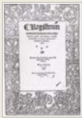
First Printed Edition of Register of Writs