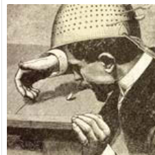
Squiggles From the Id or Straight From the Brain

Adoptive Parents vs. Tribal Rights Room for Debate asks: Should federal law let an Indian birth father take a girl from the couple who raised her?