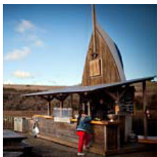
36 Hours in Marin County, Calif.